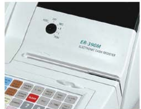
Internal Magnetic Card Reader Option