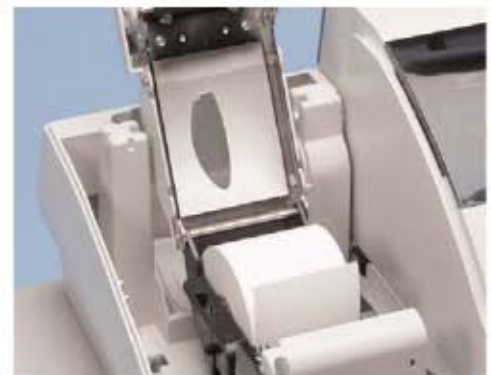
Quick and Easy Drop-In Paper Loading