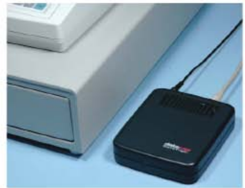
DataTran™ Integrated Electronic Payment Option