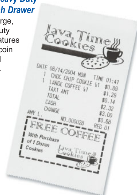
Receipt Shown 75% Actual Size